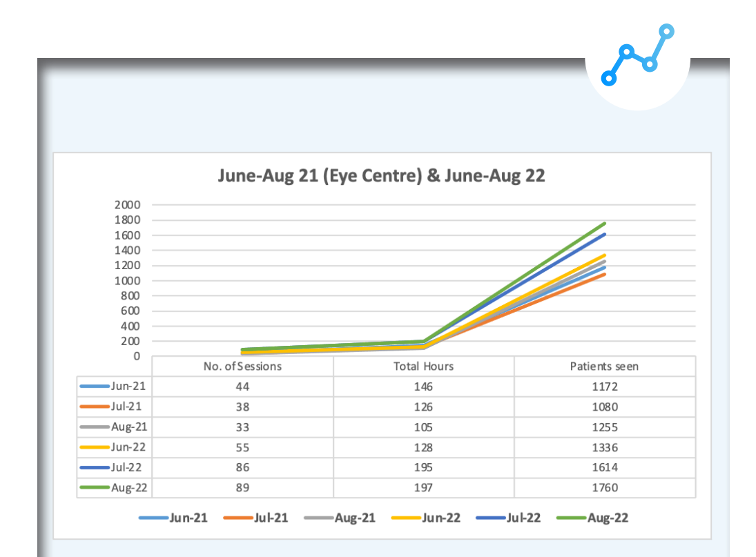
Table 1. Eye Centre Volunteering continued throughout the pandemic.

Snapshot of statistics including the volunteers' direct and positive impact on patient care (qualitative/case studies/testimonials).