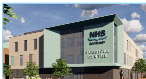
Surgical centre due to open in 2023