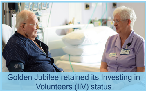
Golden Jubilee retained its Investing in Volunteers (IiV) status