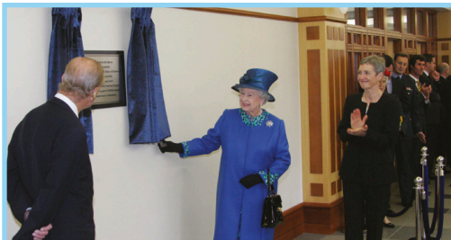
Visit from Her Majesty the Queen