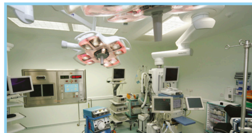
One of the new orthopaedic theatres