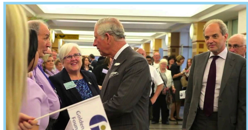
Visit from HRH Prince Charles