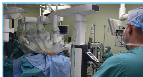
Da Vinci surgical robot