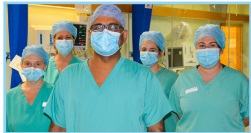
Additional clinical staff were recruited