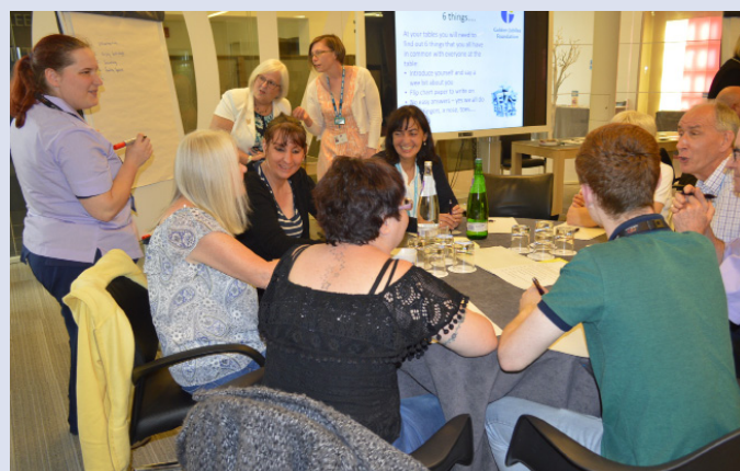
Volunteer Week is a time to say thank you