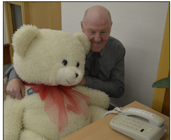
Goldie helping a member of staff out at the 'Meet and Greet' desk

On his tour of the hospital, Goldie the Share Bear popped into the Dementia Cafe as the hospital celebrated What Matters to You? Day (WMTYD) 2017.