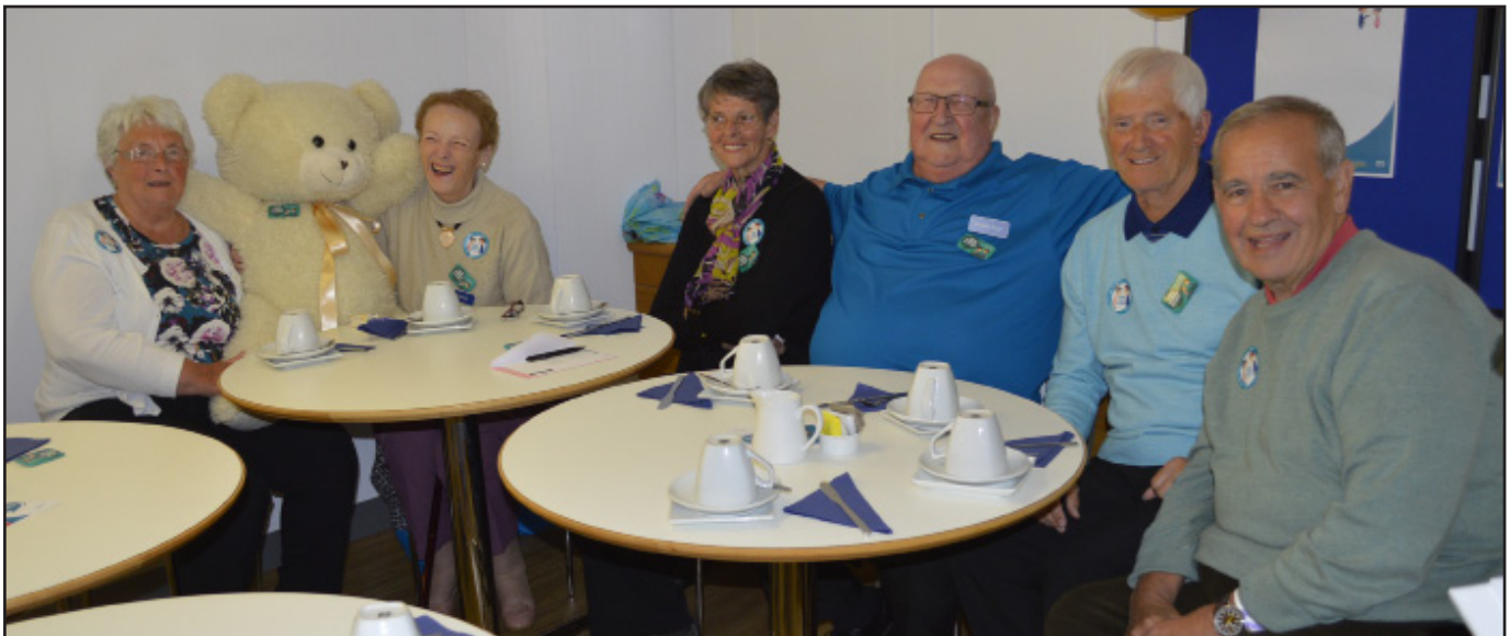
Dementia Cafe attendees participating in our What Matters to You? Day