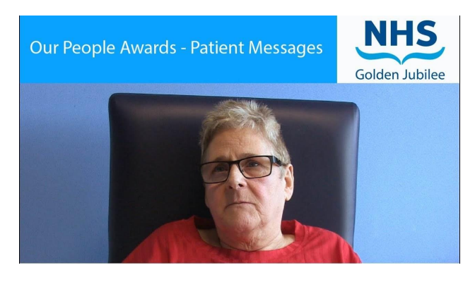
1 - Messages of support from our patients